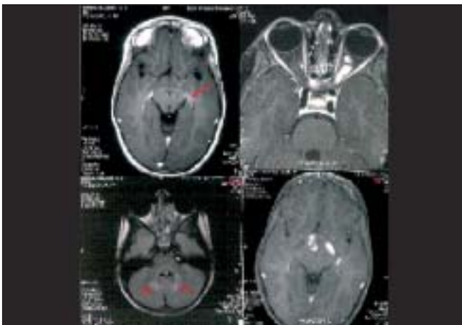
Figure 2: MRI showing involvement of the optic tracts and optic radiations (left top and bottom), the fusiform dilatation showing the optic nerve glioma (on the top right) and a post radiotherapy image showing some regression of the involvement of the optic radiations (bottom right)