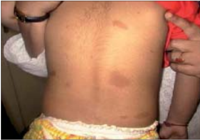
Figure 1: Café au lait spots