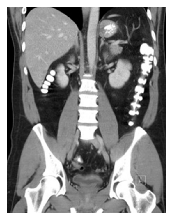
Figure 2. Follow-up computed tomography scan of patient 1 without evidence of residual or recurrent abscess.

supralevator abscess decreased in size from 6.5 by 3.5 cm to 2.5 by 0.5 cm.