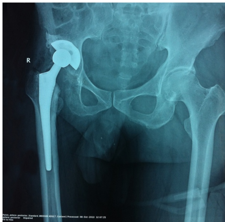
Figure 2 A post-operative antero-posterior X-ray shows placement of a metallic prosthetic joint with proper prosthetic alignment.

Total hip arthroplasty or total hip replacement has now emerged as one of the most common orthopedic procedures performed for debilitating lesions of the hip joint that lead to restriction of joint movement, pain and deteriorates the patient's living standards. The therapeutic outcome of THA has been substantial in the treatment of the osteoarthritis in comparison to the conventional techniques with