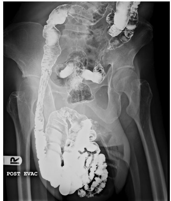
Fig. 2. Barium enema revealed ascending colon, cecum and ileum containing in the hernia sac without significant lesions of the large bowel.

He recovered uneventfully and the drain was removed before he was discharged on the seventh postoperative day. The patient was able to eat and has gradually regained weight. Small postoperative