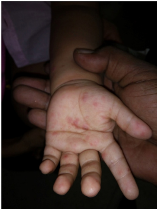
Figure 3. Papulo-vesicular lesions surrounded by erythematous zones on the left palm of a 1.5-year-old boy.