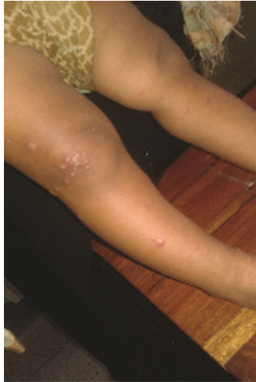
Figure 1. Multiple vesicular lesions containing turbid fluid seen in right knee of 4-year old girl.

Stringently examined thorough DD was performed to differentiate HFMD from closely similar diseases, like chicken-pox/varicella, scabies, measles, erythema multiforme, herpangina, herpetic gingivitis, drug eruptions, as several reports mentioned 1,6-8,22 . Mosquito bite was also included as report from India, underlined it as a simple yet valuable DD-point 13 . Particular attention in the DD was paid on examining the characteristics of skin lesions (macules and papules quickly evolve into small vesicles manifesting on their palms, soles, and buttocks 22 ). We observed small vesicles in majority of these children that ruptured with the formation of erosions and crusts as ascribed by Sharma et al. Alike his finding, we also observed those vesicles as 1–5 mm in size as erythematous maculopapular lesions that rapidly enlarged by 3–15 mm progressing to vesicular eruption with prominent erythematous halo 13,14 being comparable to that of a report by Bhumesh et al. from India 21 .