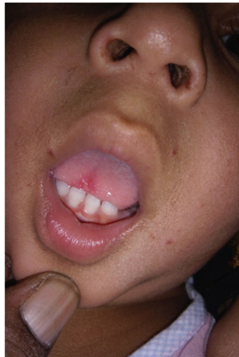
Figure 2. An oral ulcer on tongue with surrounding erythema of a 5-year old boy.