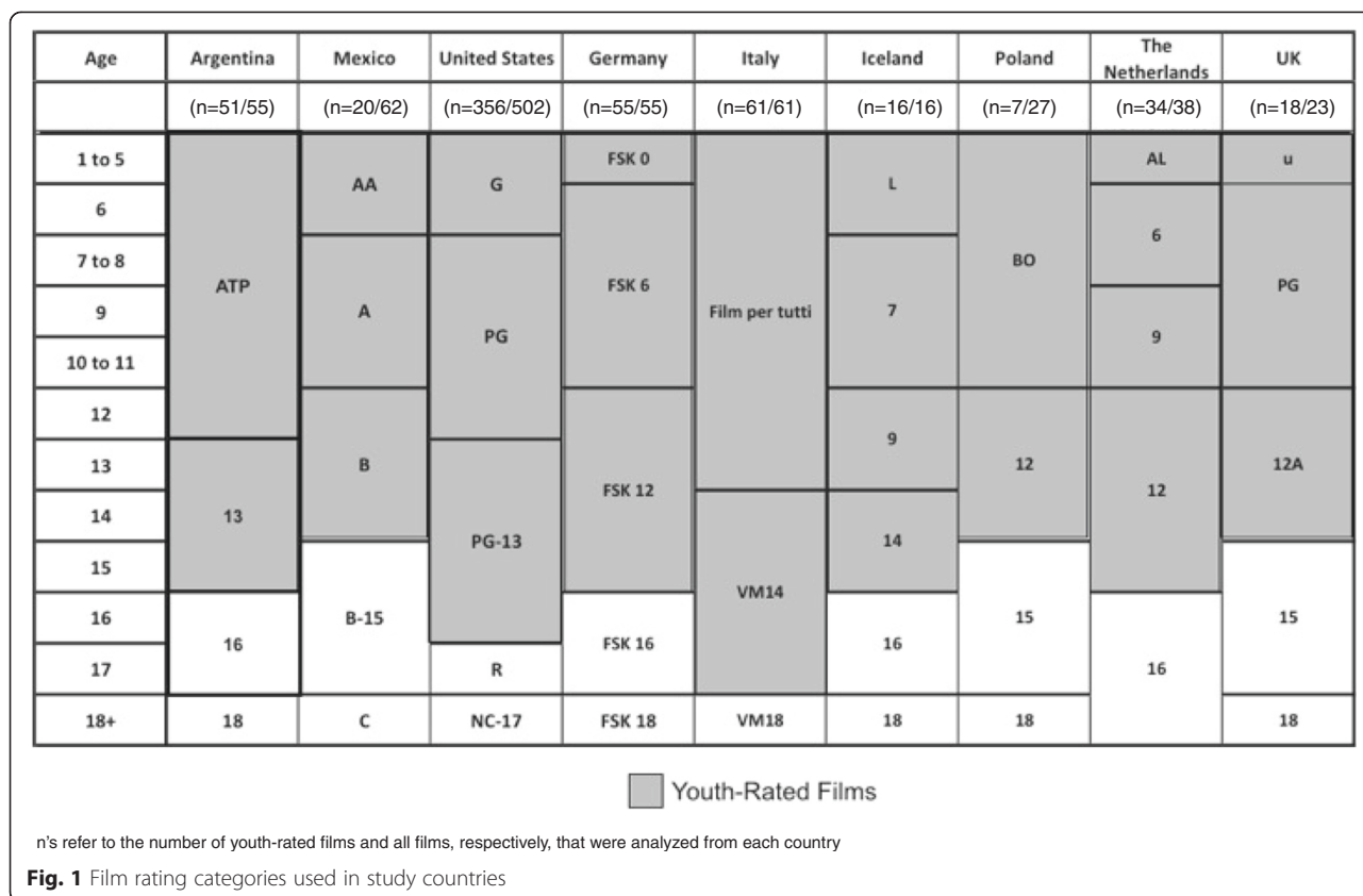
Fig. 1 Film rating categories used in study countries

manipulated for analytic purposes, a sensitivity analysis that utilized original data was conducted. Separate linear regressions models were estimated for 1) occurrences for European countries, using the UK as the comparison group; and 2) seconds for Latin American countries using US films as the comparison group. The UK was chosen as the comparison group for European countries due to the similarities in percentages of films with tobacco and alcohol between the US and the UK and the fact that many nationally produced UK films were co-produced with US companies. The main models that included seconds for all nine countries were also estimated using the UK as a comparison group.