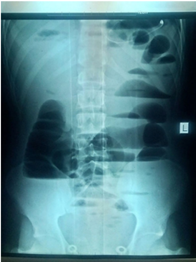
FIGURE 1 An erect plain film of the abdomen showing multiple air fluid and distended small bowel suggestive of small bowel obstruction

He was then explored through a long midline incision. Exploratory laparotomy showed a very mobile cecum and ascending colon (not attached to posterior abdominal wall), and the proximal ileum and jejunum were wrapped around the base cecum as well as ascending colon. Most of jejunum, whole of ileum, cecum, and most of ascending colon were gangrenous.