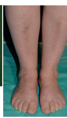
Fig. 1. Diffuse and symmetrically distributed erythematous papules and plaques on (A, B) the trunk and upper limbs, (C) the lower extremities.