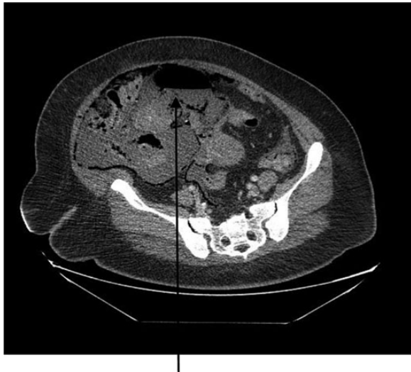
Figure 1: CT abdomen showing large air-filled right abdominal mass that appears to be a septic ovarian cyst.