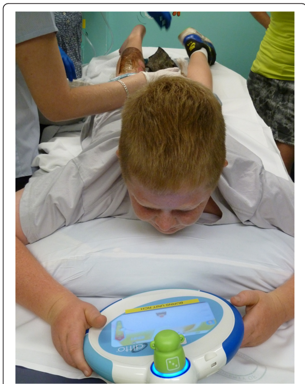
Figure 2 Patient engaging in the Ditto™ distraction phase during dressing removal. A burn patient engaging in Ditto™ distraction as nurses carry out the wound care procedures.

X = measure taken, # = Ditto™ intervention group only. COD, change of dressing; CTSQ, Children Trauma Screening Questionnaire; DA, dressing application; DR, dressing removal; FLACC, Faces, Legs, Arms, Cry, Consolability; FPS-R, Faces Pain Scale-Revised; VAS-A, Visual Analog Scale-Anxiety; LDI, laser Doppler image.