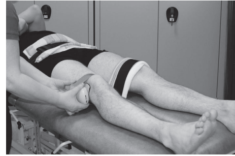
FIGURE 1: Isometric strength testing of hip abductors. Straps at pelvis and contralateral limb, as well as fixating hand-held dynamometer.

Data for this cross-sectional laboratory study were collected during baseline measurements of patients who had been referred by orthopedic specialists for a fitting and trial treatment with an unloader (valgus) brace [21]. Due to limited number of female patients at the clinic who were inclined to try an unloader brace, a decision was made to include only males in this study. Seventeen male patients (aged 40–60 years) with confirmed medial knee OA, Kellgren Lawrence (KL) grade 2 or 3 radiographic changes [22], and clinical history of pain and functional impairments fulfilled the inclusion criteria. In cases where bilateral radiographic knee OA was diagnosed, the more symptomatic knee denoted the affected one. Patients were excluded if they had joint replacement surgery, periarticular fracture, osteotomy, knee ligament reconstruction, or arthroscopic surgery to any lower limb joint within 6 months of the study. Exclusion criteria also included radiologically confirmed OA in the ankle or hip joints, intra-articular corticosteroid or viscosupplementation injection to either knee joint within 3 months of study participation, or any musculoskeletal or neurological impairment, dermatological or circulatory problems in the lower extremities that might affect ambulation. Fourteen asymptomatic male subjects were recruited from the university community to serve as controls (CTRL) and were matched