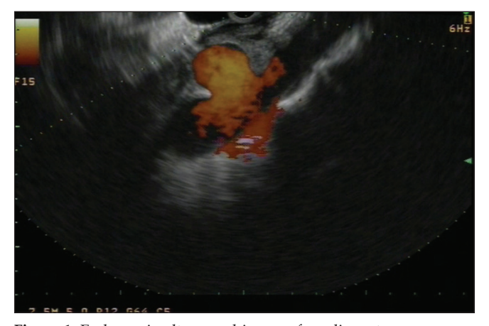
Figure 1. Endoscopic ultrasound image of a celiac artery aneurysm (white arrow) is obtained using a linear echoendoscopic and color Doppler

EUS-guided vascular access and therapy was first described in 1996<sup>[13]</sup> when Fockens and colleagues treated four patients with Dieulafoy's lesion under direct guidance of a rotating sector scanner EUS with adrenaline/polidocanol injection using a standard 23-gauge sclerotherapy needle. More recently, Levy et al. , reported a case series of five patients with refractory bleeding due to hemosuccus pancreaticus,