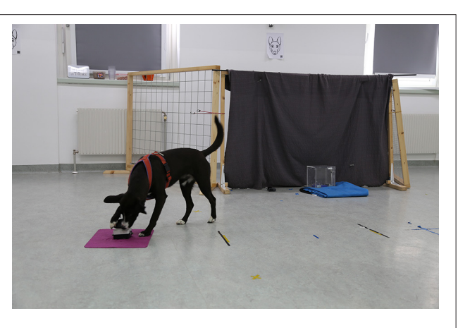
FIGURE 3 | Setup for test trials in the buzzer test. The dog presses the buzzer and the box containing the reward is opened.

In this test, the dogs were trained to press a buzzer with either the nose or paw in order to open an opaque box that contained a food reward. In the actual test, the buzzer was positioned away from the baited and transparent box, consequently the dogs needed to turn away from the visible but inaccessible reward to gain access to it by pressing the buzzer ( Figure 3 ). Hence, dogs needed to inhibit the urge to approach and manipulate the box to get the reward directly but instead move away from the reward in order to gain access to it. This test was designed to measure the dogs' motor inhibition abilities but also involved aspects of cognitive inhibition.