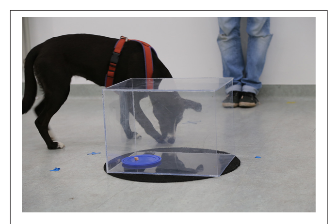
FIGURE 1 | Setup in the box test. The reward is positioned deep in the box on a lid and the box is open on the right side. The experimenter stands behind the box.

In this test, dogs were required to retrieve a piece of sausage from inside a Plexiglas-box, which was open only on one side ( Figure 1 ). The dogs consequently needed to inhibit reaching for the reward directly but instead were required to look for the open side of the box (left, right or back) to gain access, hence measuring the dogs' motor inhibition abilities. Moreover, we put the reward