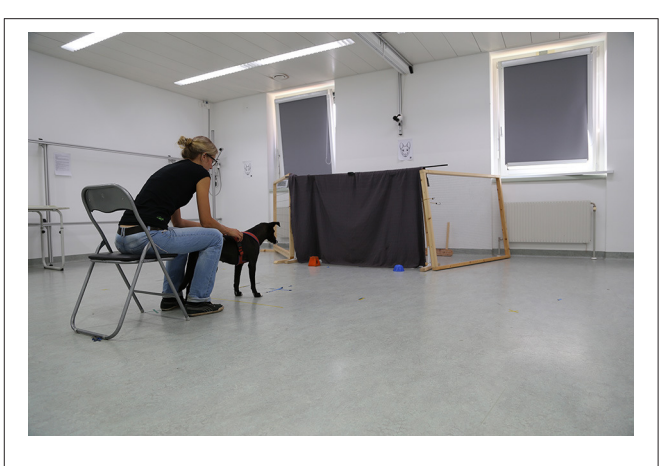
FIGURE 4 | Setup for reversal learning test. Rewards were hidden under either the orange or the blue object depending on the test group. The owner sat and held the dog 2 m behind the objects.

Two objects (an orange, rectangular, felt object and a blue, round, plastic object) were used for this test. The experimenter hid behind a curtain (to reduce the potential influence of social cues on dogs' performance), and observed the dogs via a webcam connected to a laptop behind the curtain. In order to prevent dogs from interacting with the experimenter, two fences were built around the experimenter. A webcam was mounted to the wooden frame and positioned such that the objects were in view. The owner was seated on a chair 2 m away from the curtain and instructed to release the dog from this position without any gestural or verbal comments (see Figure 4 ). Since both objects were baited through the course of the test (and often within a test day), and hence should have had equal amounts of scent on them, we did not actively control for scent cuing.