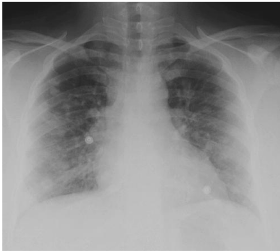
Figure 1 Chest X-ray of Case 1: A 32 year- old female presented with a 2-month history of fever, dry cough, shortness of breath on exertion and weight loss. She was treated with a number of antibiotics with no significant improvement. Chest radiograph showed extensive bilateral nodular infiltrates.