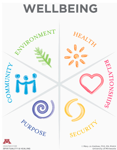
Figure 2. University of Minnesota's Wellbeing Model [6].