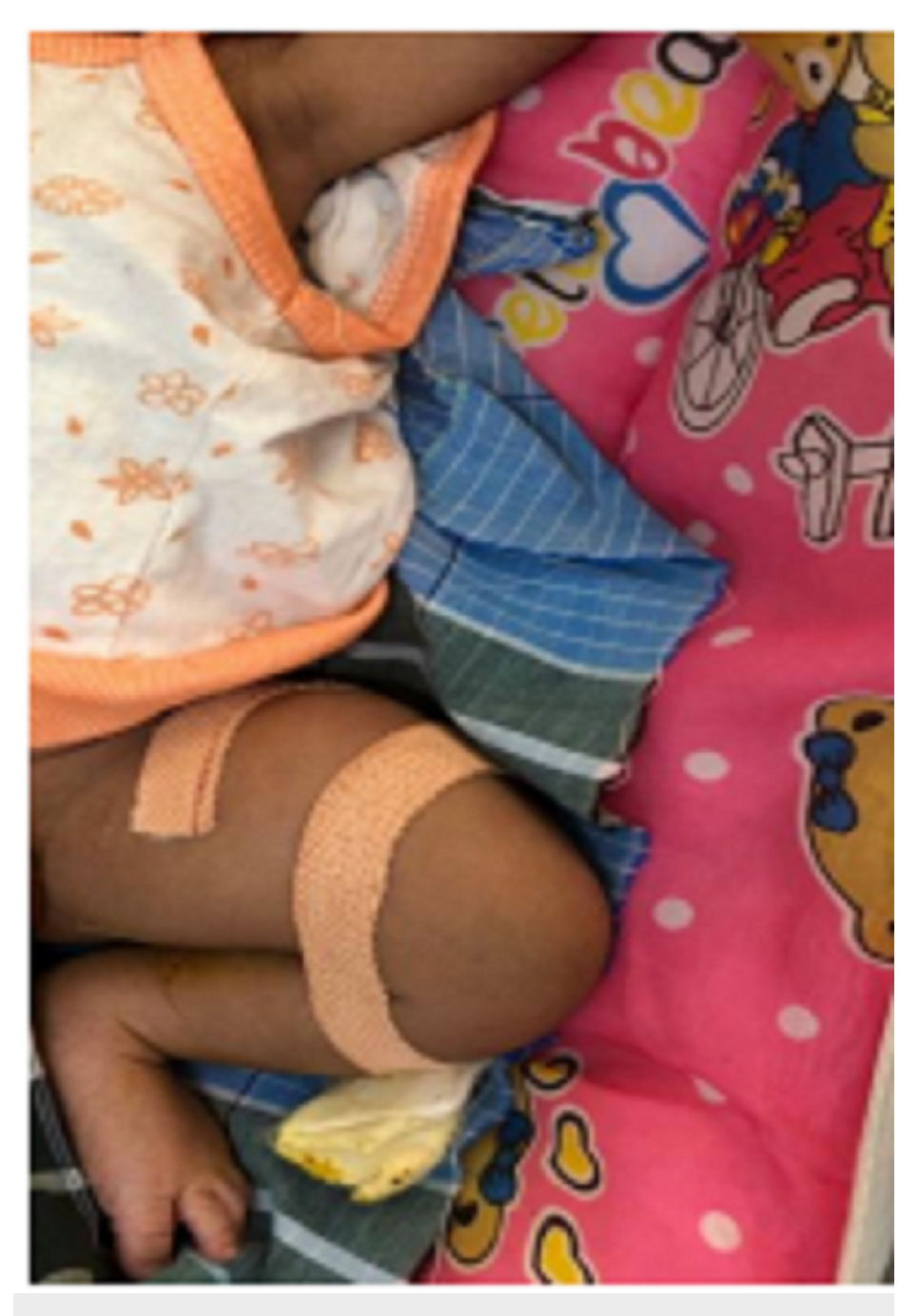
FIGURE 2: Strapping Involving Thigh and Leg