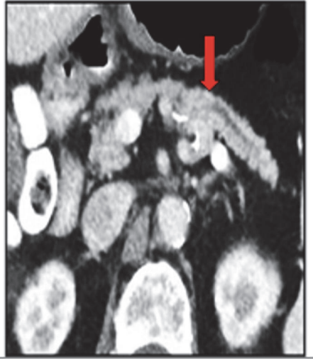
FIGURE 1: Axial abdominal CT-scan showing dilatation of the pancreas and duct cut-off sign (red arrow).

stimulating hormone was mildly elevated (9 U/mL), and anti-thyroid peroxidase antibody was elevated at 50 mg/L. She was evaluated by a psychiatrist who prescribed sertraline, as well as recommended relaxation techniques; however, her family requested further evaluation, and she was transferred to our institution. On physical exam, she had disorganized high amplitude conjugate horizontal movements of her eyes which persisted with eye closure, severe truncal ataxia that prevented her from sitting up without support, and distinct abdominal myoclonus. Otherwise, her neurological exam, including detailed mental status exam testing, was unremarkable.