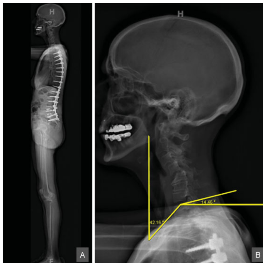
Fig. 1 (A) Whole-body lateral stereoradiography. (B) Magnified cervical spine from whole-body lateral stereoradiography.