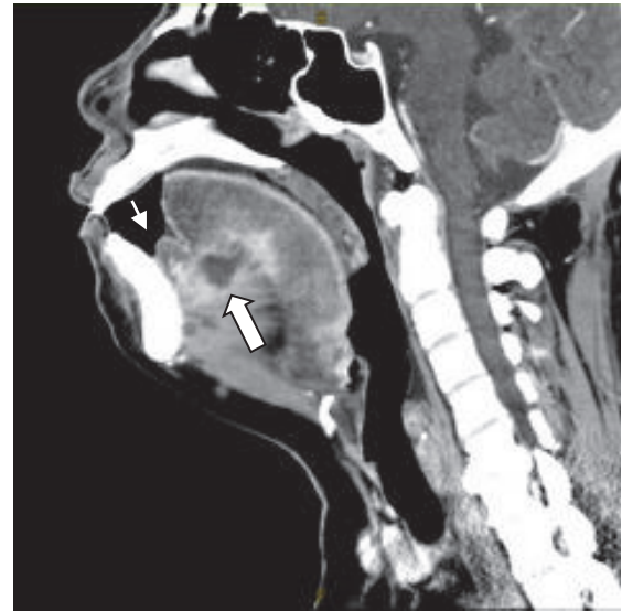
FIGURE 1: Contrast-enhanced CT scan showed the abscess confined at the ventral aspect of the tongue with sublingual space cellulitis (thick arrow) and marked swelling of anterior floor of mouth was demonstrated (thin arrow).

3.1.3. Case 3. A 52-year-old Thai woman reported having odynophagia and dysphagia for 1 week. She took amoxicillin for 5 days without signs of improvement. Her symptoms worsened, as did limitation of her tongue movement. She denied local trauma of orobuccolingual regions.