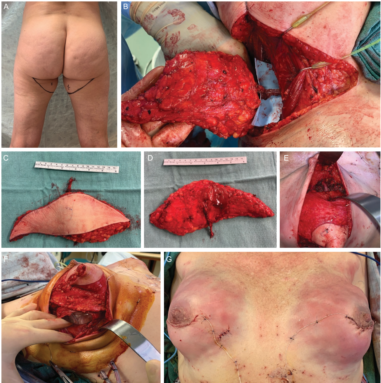
Figure 2. Intraoperative views. (A) Profunda artery perforator (PAP) flap markings. (B) Intramuscular dissection of perforators through the substance of adductor magnus. (C) Harvested PAP flap. (D) Harvested PAP flap with pedicle length of 7 cm. (E) Revascularized PAP flap with pedicle anastomosed to the internal mammary vessels. (F) New smooth round moderate classic profile gel implants (170 mL) were inserted into the capsule. The PAP flap was de-epithelialized, coned, and buried. (G) On-table appearance after completion of reconstruction with evolving breast skin and nipple ecchymosis. An area of full thickness thermal injury was excised and closely linearly on the right breast.

the mastectomy skin with indocyanine green laser angiography. Bilateral PAP flaps were harvested (Figure 2). The right and left breast flap weights were 225 and 167 g, respectively. Arterial anastomoses were performed with interrupted 9-0 nylon and veins were coupled with 2.5-mm