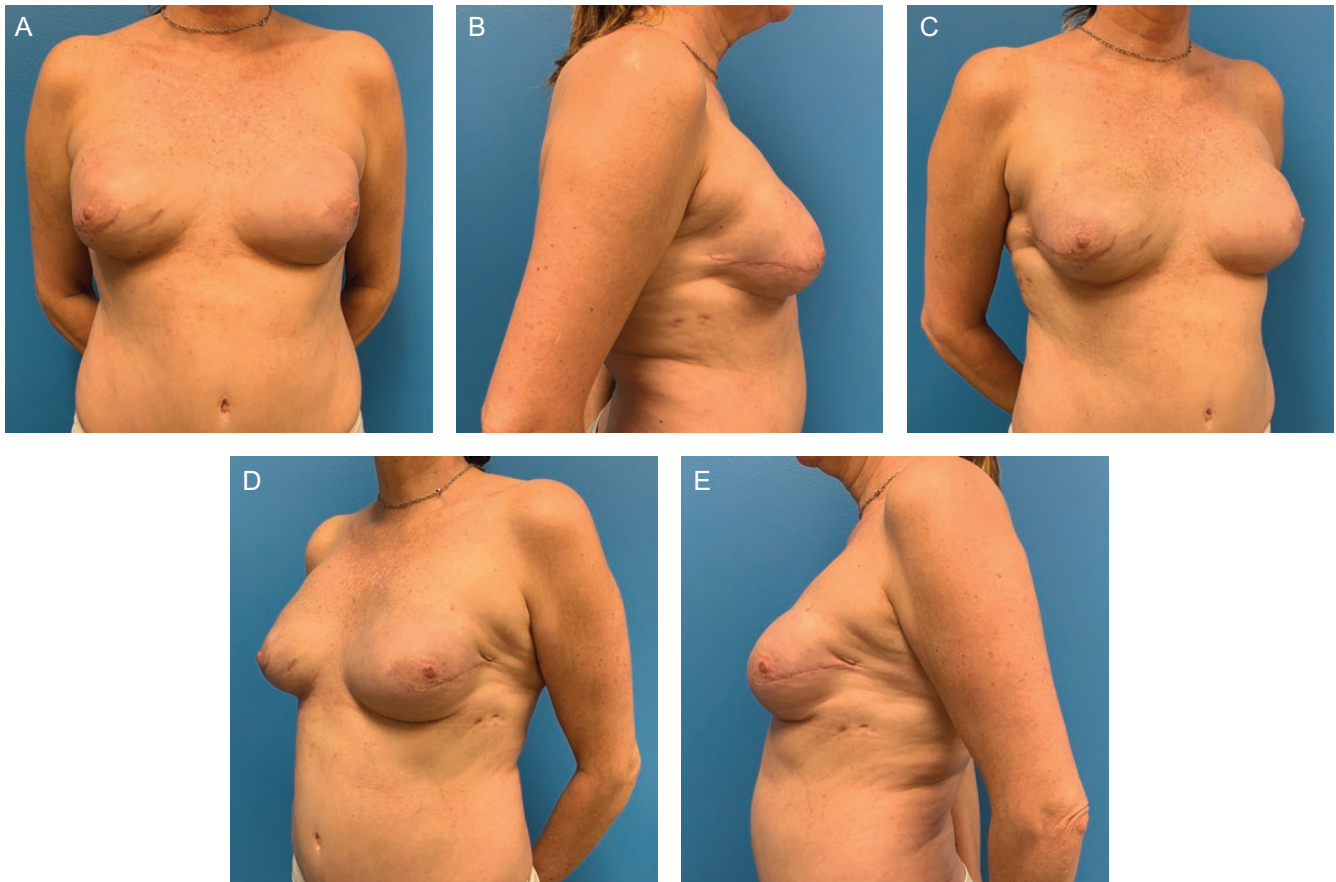
Figure 3. (A–E) Postoperative appearance at 3-month follow-up.

pocket control. Total implant coverage was achieved after flap coning. The flaps were de-epithelialized and buried with implantable Doppler monitoring. Total operative time was 9 h and 24 min (Figure 2).