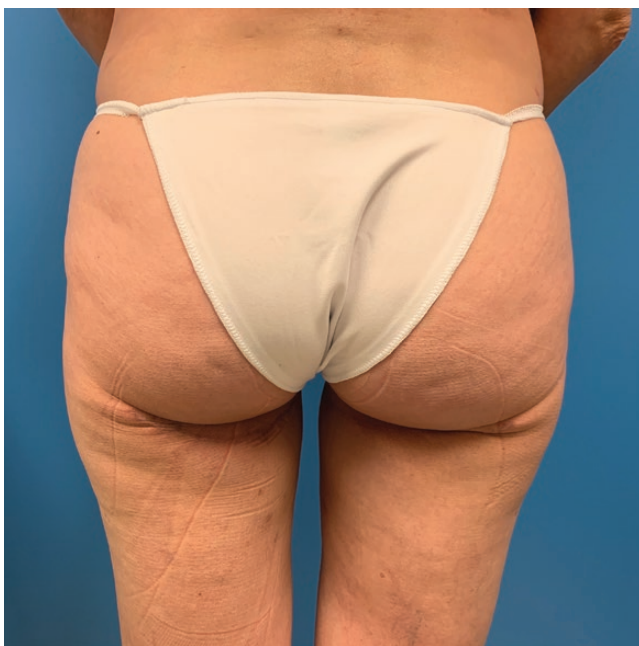
Figure 5. Postoperative donor site appearance at 8-month follow-up.

be tolerated with a well-vascularized underlying tissue flap. The addition of the implant maintains the size flexibility of the reconstruction even in thin patients and provides the added benefit of projection, which can be problematic in autologous flaps. The most classic example of the hybrid autologous-implant concept for breast reconstruction is the latissimus flap that is often combined with implant or expanders. 10 The additional protection afforded by autologous tissue may also reduce implant-related complications in the setting of previous radiation. 10 With the technical refinement and increased predictability associated with modern microvascular surgery, the use of a free flap for the tissue component should be a natural and safe evolutionary step, as evidenced by recently published experience with immediately augmented deep inferior epigastric artery perforator flaps. 6 The combination of implants with the PAP flap, which is often the only available donor site in thin women, is especially palatable in patients with low body mass indices. The projection advantages of the implant combined with PAP flap coning create aesthetically complementary benefits.