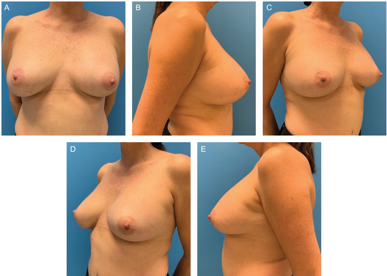
Figure 1. Preoperative views of this 54-year-old female with BRCA gene mutation with submuscular smooth round 200-mL saline implants presenting for prophylactic nipple-sparing mastectomies and immediate reconstruction. She previously underwent traditional abdominoplasty. Body mass index was 23 kg/m 2 .

Options to increase breast volume and projection of autologous reconstructions include fat grafting, flap stacking, and implant augmentation. 3–5 Flap augmentation using implants is conventionally performed secondarily, but immediate prosthetic insertion during flap reconstruction has also been described with or without use of a bioprosthesis adjunct for implant control. 5,6 Advantages of immediate implant augmentation of flaps include potential for single-stage reconstruction to a larger desired size and improved device coverage. 6 Possible disadvantages include risk of flap compromise, prosthetic infection, and implant malposition. 5,7