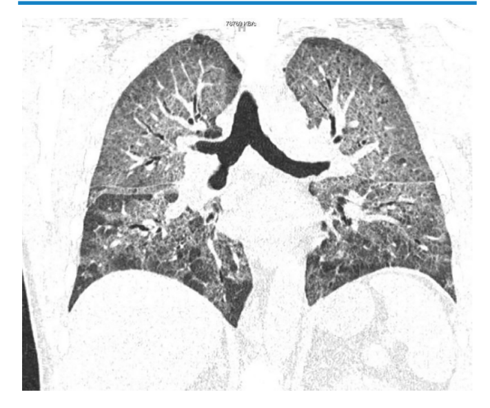
Figure 1. HRCT showing extensive and severe bilateral ground glass opacities. There is mild pleural thickening seen within the major fissures bilaterally and scattered lucencies seen within the chest wall extending to the bilateral axilla.

Pathology is the gold standard for diagnosing APT; however, a lung biopsy is not necessary in every patient.<sup>9,10</sup> The histopathologic findings of APT include lipid laden macrophages in airspaces, nonspecific interstitial pneumonitis, type II pneumocyte hyperplasia, interstitial edema, and fibrosis.<sup>11</sup>