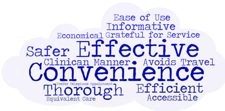
Fig. 2 Word cloud of positive themes