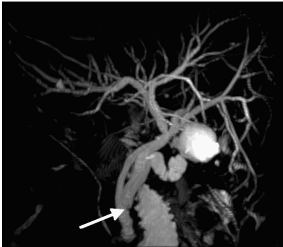
FIGURE 1: MRCP image showing low insertion of the cystic duct stump with distal calculus (white arrow)

MRCP: magnetic resonance cholangiopancreatography