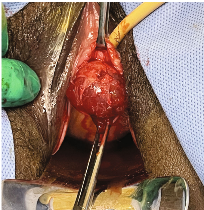
FIGURE 1: Gelatinous cystic mass protruding from the anterior vaginal wall.

and pelvic pressure with discomfort; however, she denied having vaginal discharge, pain, urinary urgency, urinary frequency, or vaginal odor. MRI performed on 11/15/21 reported a mass that was difficult to localize, possibly along the posterior vaginal wall.