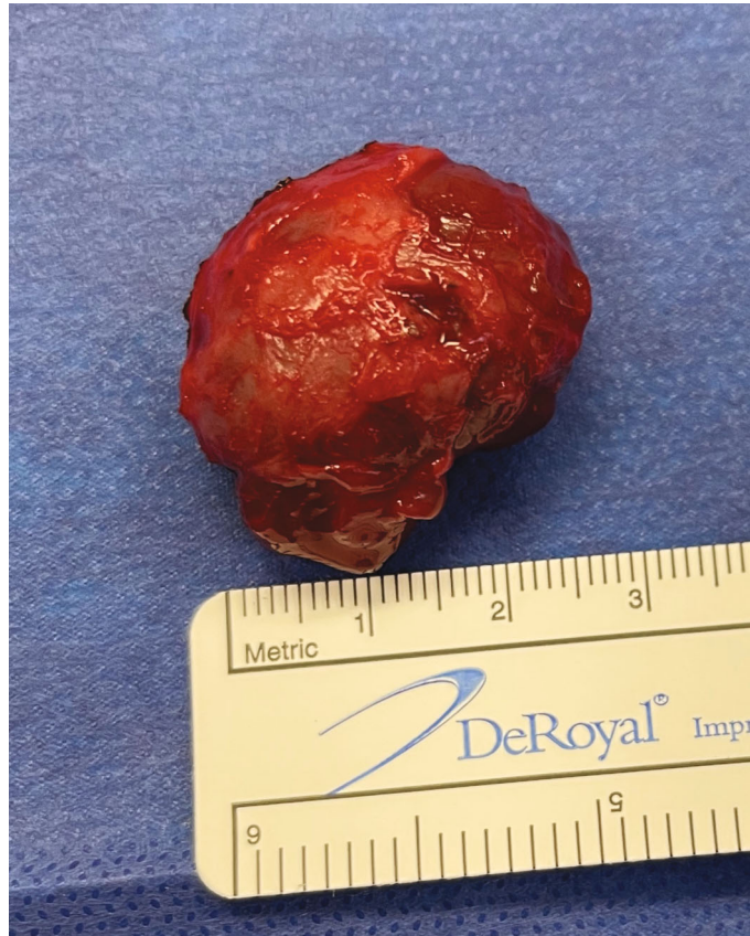
FIGURE 2: Gross specimen of the AA that was removed measuring about 2.75 cm in diameter.