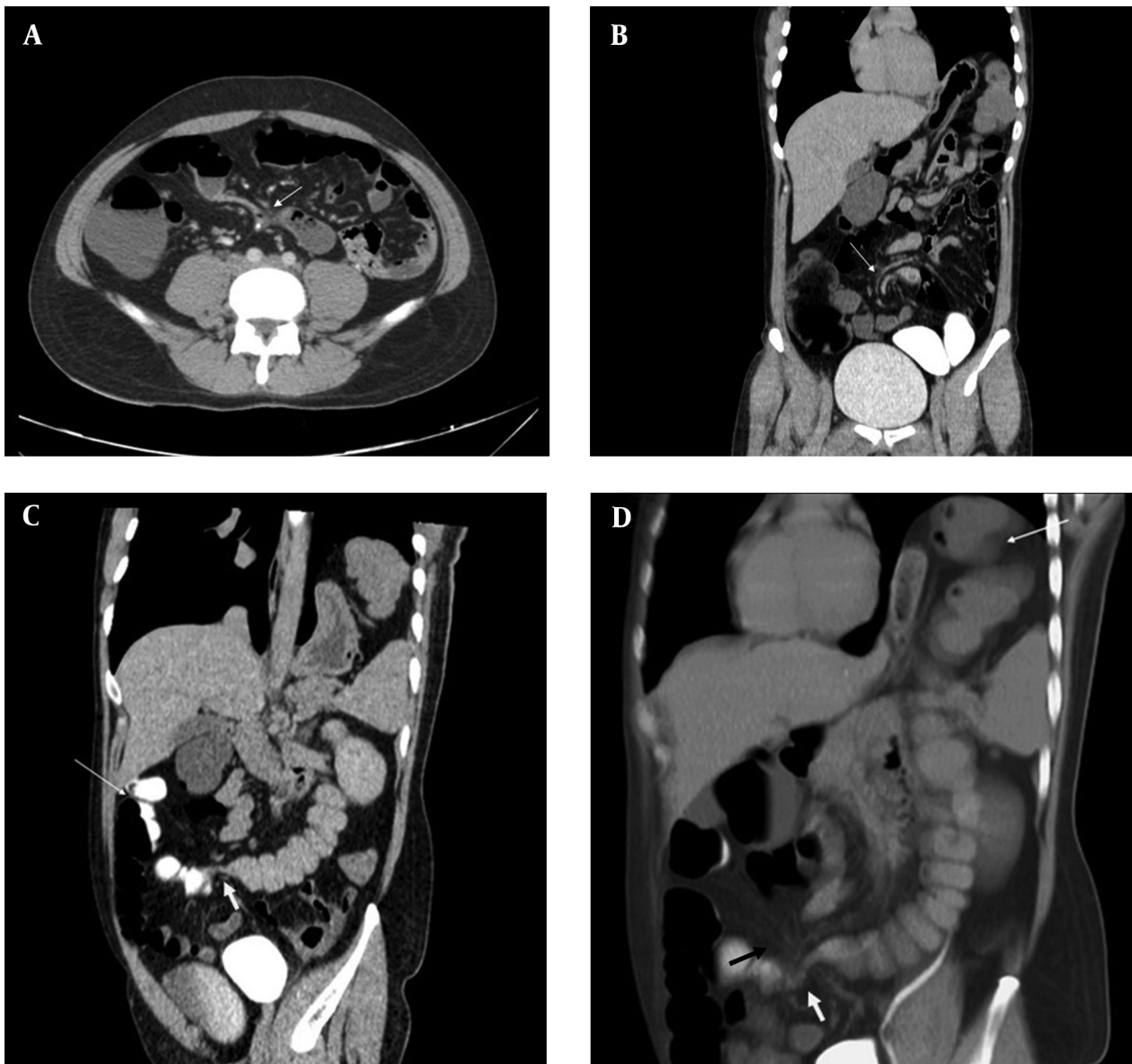
Figure 2. Multi Detector Computed Tomography (MDCT) of abdomen with positive rectal contrast. A, Axial image shows short segment narrowing of the sigmoid colon (white arrow) at its junction with descending colon. B, Coronal and oblique image reveals twisting of sigmoid colon mesentery with beaking at site of volvulus (white arrow) and crowding of vessels. C, Redundant sigmoid colon (thin white arrow) reaching up to lower border of liver with abrupt narrowing of sigmoid colon at the site of partial volvulus (thick white arrow). D, Eventration of left hemidiaphragm and upwards migration of splenic flexure (thin white arrow) with convergence of vessels (black arrow) and abrupt narrowing (thick white arrow) at the site of twist.