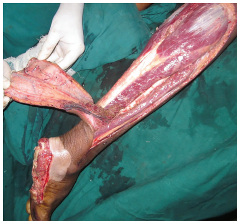
Fig. 4: Elevated flap with the peroneal vessels and part of the flexor hallucis longus muscle. Sural vessels, short saphenous vein, peroneal vessels and tendoachilles with paratenon seen in the picture.

from flap and fibula. Periosteum of this side fibula separated from bone through which we directly go to the peroneal artery (Figure 2). Now upper end of the flap dissected subfascially and short saphenus vein along with sural artery and sural nerve were included in the flap (Figure 3). Medial side of flap then subfascially elevated till (septum) those perforators which were initially identified. Now peroneal artery with venae comitantes ligated proximally and then flap elevated from here to distal side (Figure 2).