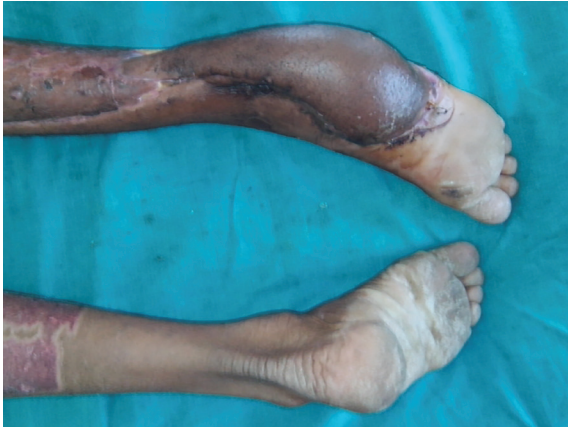
Fig. 12: Completely healthy flap on 20 th day of surgery.

their problems. Although free flap can provide sufficient tissue for reconstruction, not all patients are suitable candidates for free tissue transfer because of the existing comorbidities and economic problems. 8-10