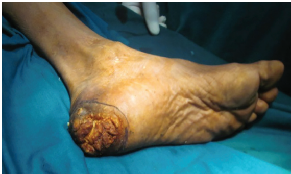
Fig. 10: Verrucous carcinoma of the heel underwent wide local excision and reverse peroneal artery flap coverage.