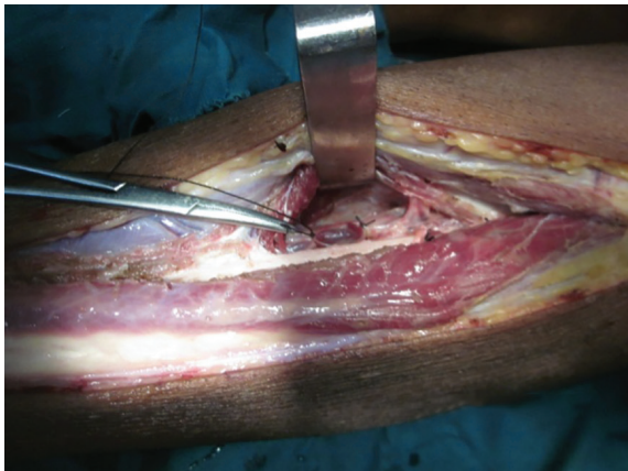
Fig. 2: After elevating the fibular side of the flap, peroneal perforators identified and peroneal vessels ligated proximal to the most proximal perforator entering in to the flap. A big perforator seen entering in to the flap just below artery forceps.