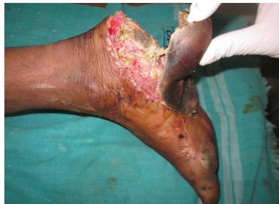
Fig. 9: Avulsion of sole up to forefoot due to road traffic accident. Calcaneum bone get exposed here.