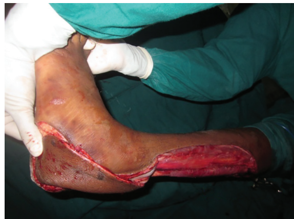
Fig. 7: Wide local excision with reverse peroneal artery flap coverage. Peroneal vessels seen in the flap.

There were minor problems at the donor site over the lower tendoachilles (graft loss) area in 3 patients, were covered with the reversal of left flap after final inset on postoperative day 18 th (Figure 8). In one patient deep infection settled down which leads to 4 cm exposed lower fibular segment. The wound was debrided and 5 cm of bone removed with left flap coverage on 18 th day. All donor sites completely healed in 4 weeks. There was no need of re-grafting in any patient. After 7-10 days of primary surgery, patient discharged and followed after 18 days for final inset.