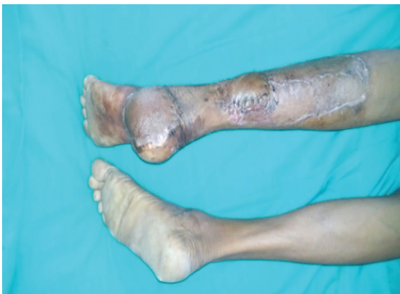
Fig. 8: Final appearance after flap inset.

Soft tissue defects of variable etiology, like post-traumatic tissue loss (5 cases) (Figure 9), verrucous carcinoma of the foot (3 cases) (Figures 10 and 11) and squamous cell carcinoma (2 cases) were covered. The flap dimensions ranged from 21×10 cm to 28×14 cm in size. All of these flaps were completely survived. There was no incidence of partial flap loss, marginal necrosis or venous congestion in any of these patients. The graft take was generally satisfactory and all the patients were ambulant after 4 weeks following the surgery.