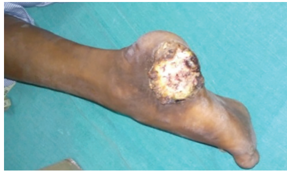
Fig. 11: Verrucous carcinoma of the heel region of the foot.

These cases were advised dressings, twice-a-week, on OPD basis. Details of etiology, flap dimensions and complications have been summarized in Table 1. The average period of follow-up was 1 year. Patients were asked to use crepe bandages for 6 months. None of the patients reported problems associated with weight bearing. None of the patient had recurrence of tumor. Aesthetic and functional outcome was good in all patients (Figure 7, 8, 12, and 13). All patients showed their satisfaction for outcome.