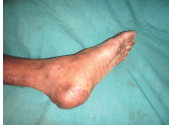
Fig. 13: Completely functional and aesthetic look after 3.5 months of the flap surgery.

Perforators were not marked pre-operatively in this study, it may be safer for beginners to do so. In our experience, these perforators were mostly direct septocutaneous perforators. Intramuscular course sometimes present, is through the flexor hallucis longus, and is very short. Thus, dissection of the perforator to the peroneal vessel is quick. Once the perforator