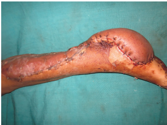
Fig. 6: Healthy flap with the almost complete graft uptake seen on 4 th postoperative day dressing.

Of 10 patients, 6 were men and 4 were women, with an average age of 45 years (35–60 years).