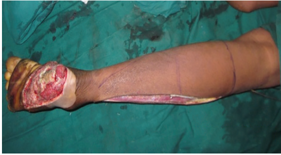
Fig. 1: Defect preparation and flap marking of the reverse peroneal artery flap. Marking was planned in reverse. Base of the flap was between tendoachilles and lateral malleolus and 5 cm above the lateral malleolus. Lateral border of the flap marked over fibula and medial border marked in such a way that short saphenous system included in the flap. Fibular side of the flap dissected and peroneal vessels ligated at this stage after confirming the entrance of the proximal perforators in to the flap.