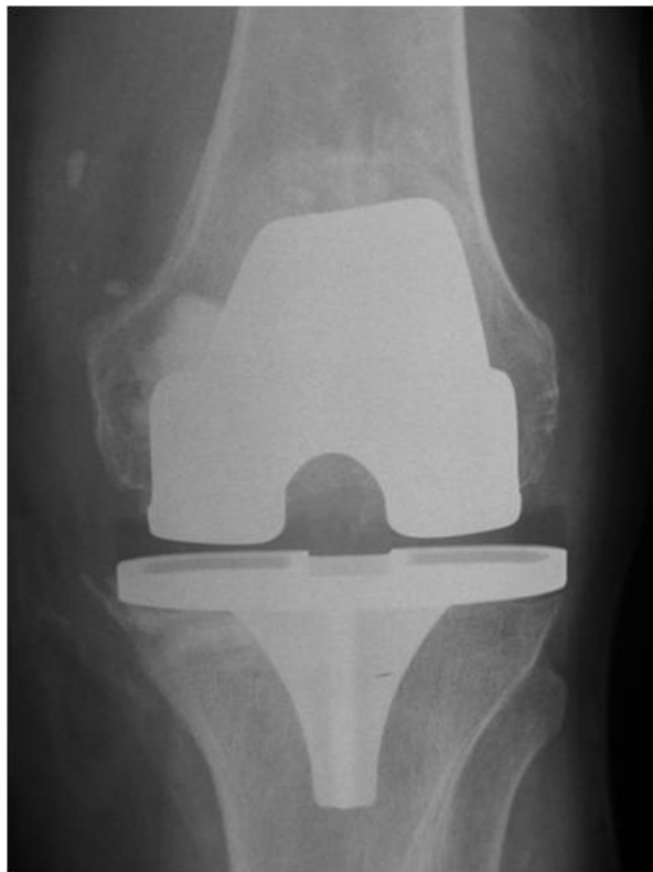
Figure 6 AP radiograph of the knee demonstrating the area of calcium phosphate bone cementage in the medial femoral and medial tibial condyles.

grafting in 2000, following severe polyethylene delamination, osteolysis and component loosening. However, treatment decisions are also very much dependent on non-joint patient factors, such as the patient's clinical status and physiological age, comorbidities, and activity levels [8-11], and our patient was deemed no longer medically fit to undergo any kind of extensive or invasive surgery. He thus underwent minimally invasive cyst debridement and grafting alone.