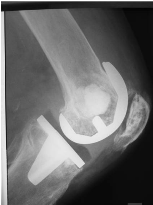
Figure 5 Lateral radiograph of the knee demonstrating the area of calcium phosphate bone cementage in the medial femoral and medial tibial condyles.