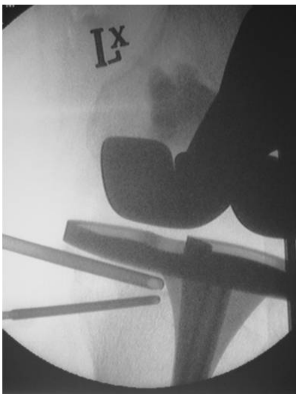
Figure 3 Fluoroscopic image of the left knee showing the introducing cannula and simultaneous venting of the medial tibial condylar cyst.