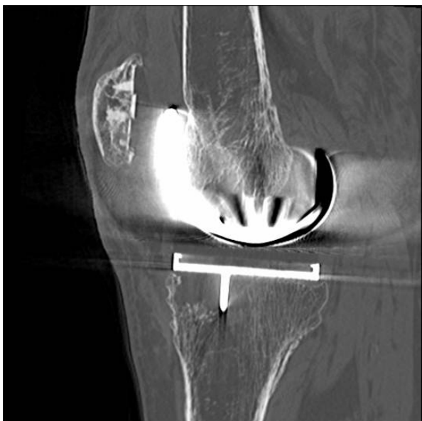
Figure 2 Sagittal CT demonstrating the lytic area in the antero-medial aspect of the tibia.