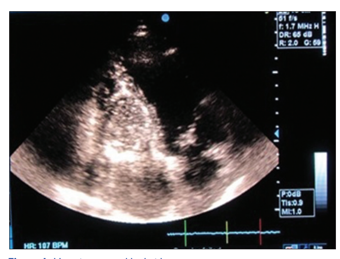
Figure 1: Huge intra septal hydatid cyst