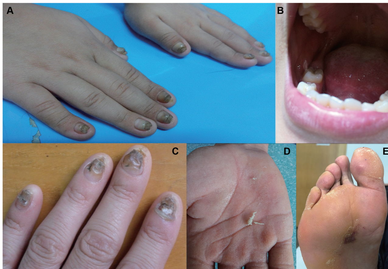
Figure 1 Clinical manifestations of patients. (A) Thickened and dark fingernails. (B) Oral leukokeratosis. (C) Thickened and discolored fingernails. (D, E) Palmar hyperhidrosis and palmoplantar keratoderma.

PC encompasses a group of rare inherited ectodermal dysplasia disorders. Three of the most common clinical features associated with PC cases are thickened toenails, plantar keratoderma (mostly focal), and plantar pain. There is considerable overlap between PC1 and PC2 11–13