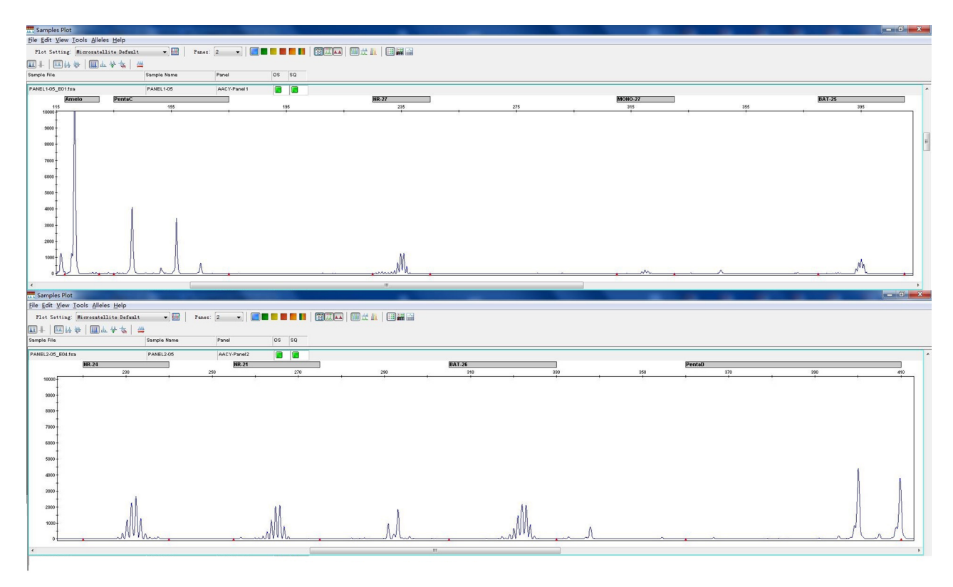
Figure 2 Example of microsatellite stability status.