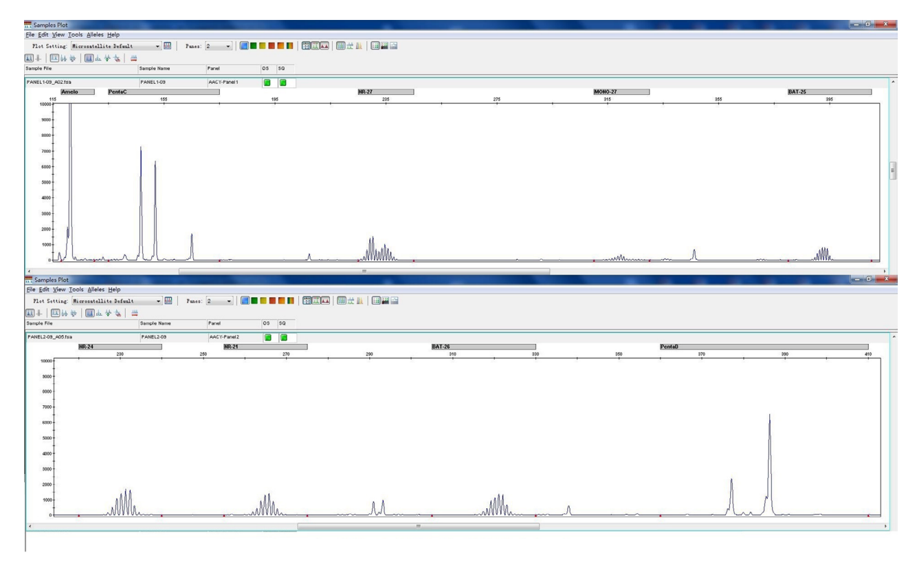
Figure 3 Example of microsatellite instability status (MONO-27 and NR-27 had changes).