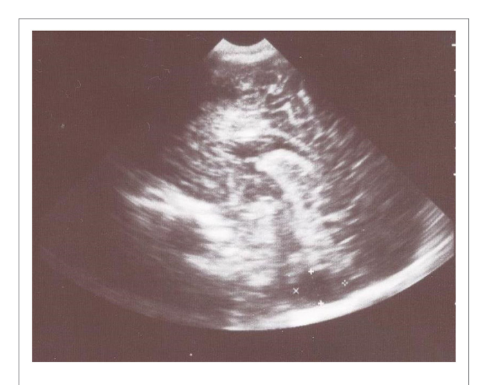
FIGURE 1 | Transfontanelle sonography shows large cyst-like cisterna magna that suggested cerebellar hypoplasia and slightly dilated frontal horns of the lateral ventricles.

Her disease started in the first 2 months after birth with developmental delay: there was no head control and no visual pursuit of objects at 2 months of age. There was also sucking discoordination and slow head growth. Abnormal movements like epileptic spasms started during the third month. Interictal sleep EEG demonstrated background slowing without hypsarrhythmia. Prolonged EEG was not recorded. Transfontanelle sonography showed slightly dilated