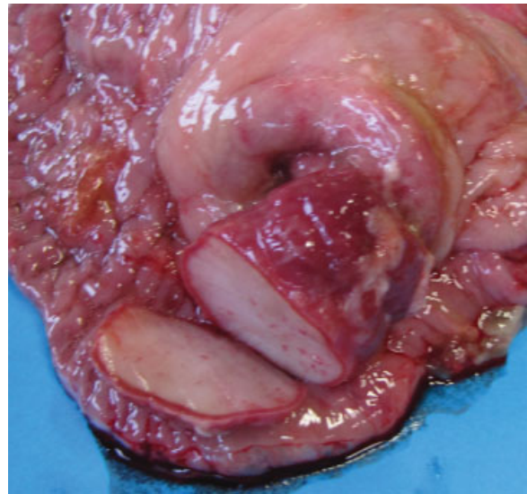
Fig. 1 A polyp, cut open, showing surface ulceration.

The patient has been symptom-free after a year of follow-up, and remains under clinical surveillance.