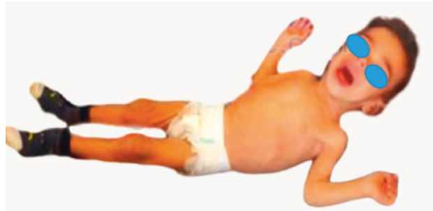
FIGURE 1: Picture of the child showing loss of subcutaneous fat.

and left eye nystagmus. No deficits of movement and coordination were noticed. Deep tendon reflexes were normal as well as cranial nerve function and testing.