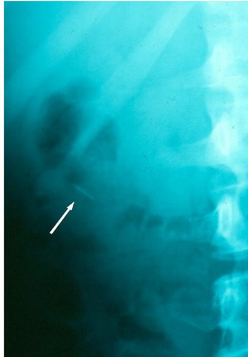
Figure 2. Radiographic tracking view, confirming the archwire fragment location in the colon, during its safe passage through the GIT.

archwire fragment had passed safely and uneventfully through the gastrointestinal tract (Figures 2 and 3). Following discharge there was rapid recovery to full health. Orthodontic treatment was resumed and completed successfully without further incident.