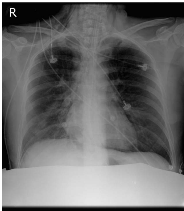
Figure 2. Plain chest radiography in the intensive care unit revealed subcutaneous emphysema over the neck region and suspected pneumomediastinum.

Although we hydrated the patient with 5% dextrose in normal saline [D5NS] at 125 mL/h after she was admitted to the ICU, it only partially resolved the starvation ketoacidosis. In addition, although aggressive treatment is indicated for an asthma attack, we were concerned with the possible pharmacologic acceleration effects that the beta-agonist and corticosteroid might have on ketoacidosis and the adverse effects of long-term high-dose propofol usage in pregnancy. [10] Due to the potential harmful effects of ketoacidosis and uncontrolled asthma, we performed an emergency caesarean section under general anesthesia after administering 2 doses of betamethasone (12 mg, 24 h apart) to prevent fetal respiratory distress syndrome. The patient delivered a 2.3-kg girl 29 h after admission. The umbilical cord arterial pH was 7.143, and the 5-min Apgar score was 9 although the child received intensive care for 2 days due to grade II respiratory distress syndrome. She was successfully extubated 20 hours post-delivery due to rapid resolution of the metabolic derangement (Table 1, Fig. 2). Subsequent panendoscopy revealed superficial gastritis although both the mother and the baby were ultimately discharged safely.