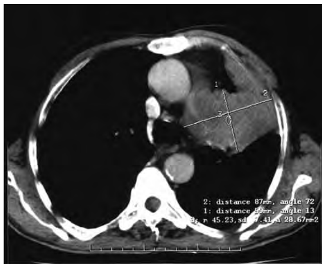
Figure 2: Chest CT scan showing left mid lobe mass