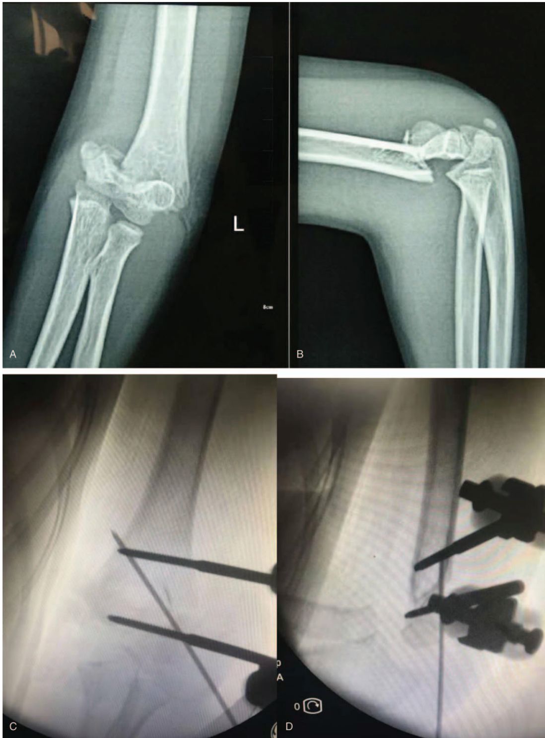
Figure 3. Radiograph of supracondylar humeral fracture fixed by radial external fixator. (A) Anterior-posterior view of supracondylar fracture. (B) Lateral view of supracondylar fracture. (C) Anterior-posterior view of supracondylar fracture after the operation. (D) Lateral view of supracondylar fracture after the operation.

The patient was discharged in the 1st postoperative day with posterior slab on the operated elbow. The cast was removed after 3 weeks. Oral analgesics were continued until the 1st follow-up visit. The patient's guardians were educated for the regular pin-site dressing to prevent the infection.