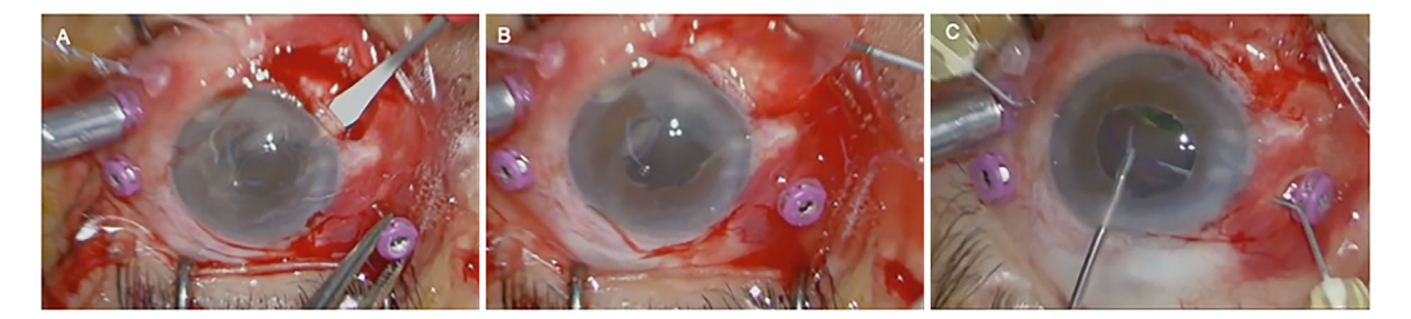
Fig. 1 Procedure for the removal of a PMMA IOL at the inferior schlerocorneal incision in the left eye of the first case (surgeon's view). a A limbal incision is created in the 8 o'clock position after a 6-mm schlerocorneal incision is created in the inferior conjunctiva. b Removal of the

with 10-0 nylon thread, vitrectomy was performed using the Constellation Vitrectomy System. A new 3-piece soft acryl IOL (NX-70; Santen, Osaka, Japan) was inserted using an IOL injector in the original sclerocorneal incision used for IOL removal. When the patient's nose interrupted the manipulation of the IOL injector, the IOL was inserted in the 2.2-mm superior corneal main port. The inserted IOL was fixed in the sclera using Yamane's method (Fig. 1c) [9]. After this sutureless intrascleral fixation of the IOL, an acetylcholine chloride (Ovisot; Daiichi Pharmaceutical, Tokyo, Japan) solution was added to the anterior chamber to confirm the presence of vitreous prolapse. Finally, all of the ports for vitrectomy were removed. If leakage was observed at the ports or corneal incision, suturing was performed.