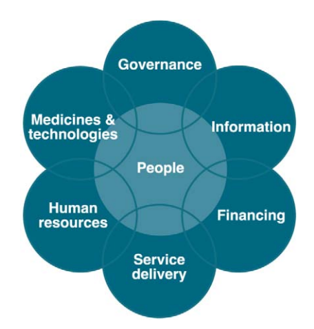
Figure 1. Health system building blocks [7]. Image credit: Fusión Creativa. doi:10.1371/journal.pmed.1000397.g001

control interventions, supported by strengthened health systems. The second phase—sustained control—aims to prevent the resurgence of malaria by maintaining universal intervention coverage until countries enter the elimination stage. In the final phase—elimination and eradication—it is estimated that more than 20 lower burden countries around the world will be poised to eliminate malaria.