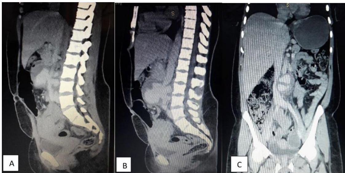
Figure 2: (A&B) Sagittal views of contrast enhanced CT of the abdomen (arterial phase) of a 37-year-old female showing multiple anterior and posterior saccular aneurysms. The eccentric filling defect on the anterior aneurysm is a thrombus. (C) Coronal view shows the compression of the inferior vena cava by an aneurysm

Imaging plays a vital role in the diagnosis and follow up of patients with aortic aneurysms. It can also give a clue to the risk or causative factors. US is usually the cost-effective initial imaging modality used in diagnosis of aneurysms as seen in this patient, it is safe and widely available. 9 Cross sectional images like CT and MRI are integral component in the diagnosis, follow up and management of AAA. 1 In this patient, US was able to demonstrate the aneurysms, the intraluminal thrombus and turbulent flow on Doppler interrogation. The abdominopelvic CT done, better demonstrated the aneurysms as regards their exact locations, proximity to each other and size measurements. It also helped to rule out atherosclerosis in this patient, however, the