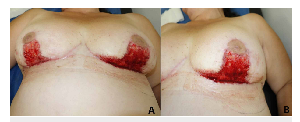
FIGURE 3: Second dehiscence. Left breast is shown closer. Note sparing of Nipple areola complexes (NAC)

assessed adequate evolution of skin grafts.