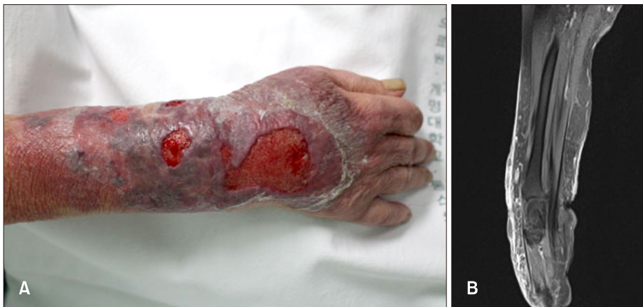
Fig. 1. (A) Tender multiple ulceration and several hemorrhagic bullae with erythematous base on the right forearm area. (B) Diffuse subcutaneous swelling with reticular enhancement was noted. Swelling of dermis and the peripheral region is noted. These lesions show heterogeneous signal intensity on both T1WI and T2WI without significant enhancement.