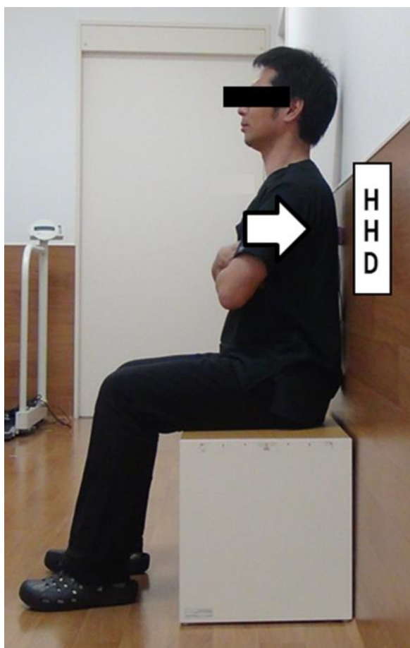
Fig. 5. The scene of the measurement of back muscle strength.

analysis. If the measured strength level increased by more than 10% from the first attempt, patients were asked to perform one additional attempt. The subjects received a full explanation of the method prior to measurements and practiced the motions. Fatigue was taken into consideration by allowing rest periods of at least 30 seconds between the measurements.