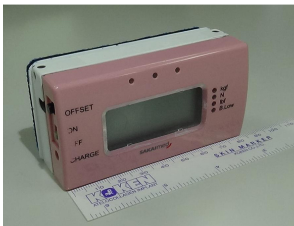
Fig. 4. Back muscle strength measurement device (Mobie MT-100).