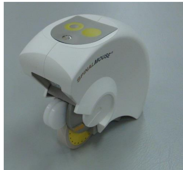
Fig. 1. Spinal alignment measurement device (Spinal Mouse®).

Maximum gait speed was assessed using a 10-meter walk test [13]. Three meters were provided at the beginning and end of the 10-meter