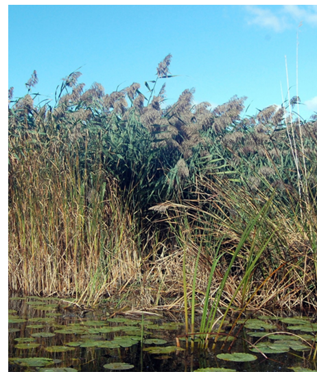
FIGURE 3 | Invasive Phragmites australis in a Great Lakes coastal wetland.

This highly invasive plant spreads rapidly through seed dispersal, stolons, and rhizomes. Phragmites invasion displaces native plants and decreases wetland biodiversity, primarily because of its aggressive root system and tall, dense canopy that shades out other wetland plants (Chambers et al., 1999). It also may exude phenolic gallic acid as a form of allelopathy (Rudrappa et al., 2007; Bains et al., 2009), but the significance of that trait is not clear (see Weidenhamer et al., 2013). The presence of Phragmites is known to impair recreational use of wetlands and shorelines, decrease property values, increase fire risk, and reduce public safety when proximity to roads disrupts driver visibility (Warren