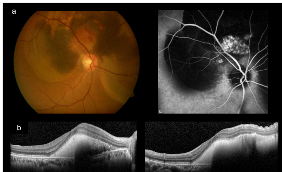
Fig. 1 Fundus appearance and angiographic findings at onset. a Fundus photograph showing subretinal hemorrhage that was centered superior nasal to the optic disc and overhung the macula. There seemed to be different regions of hemorrhage, colored yellow, bright red, and dark red. There was also serous retinal detachment surrounding the optic disc superiorly at 270 degrees. Indocyanine green fundus angiography showing leakage from multiple tufted vessels superior and superior nasal to the optic disc creating the hyperfluorescent area in the image. b Optical coherence tomography showed submacular hemorrhage without macular hole. (right; horizontal scan, left; vertical scan)

Several mechanisms for MH formation have been previously hypothesized: anteroposterior and tangential traction caused by vitreous incarceration in a needle entry site [5, 6], exacerbated tangential traction from contraction of the vascular membrane [5, 6], and critical