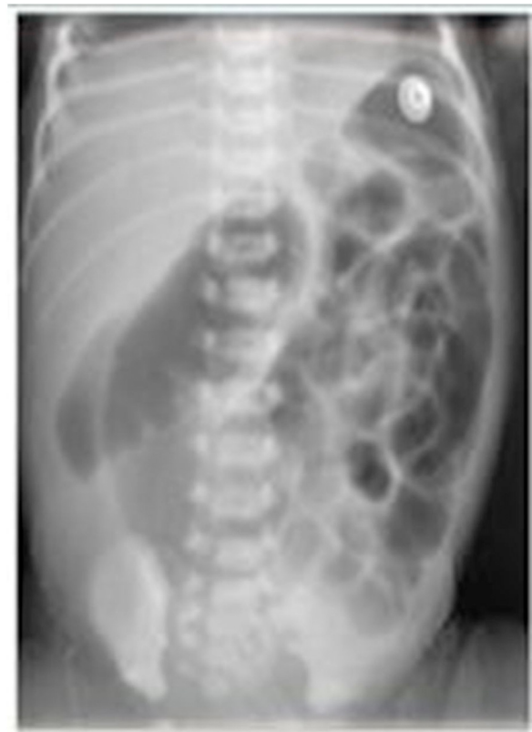
Fig. A1. Plain abdomen X-ray showing distended bowel loops of variable sizes and no pneumoperitoneum.