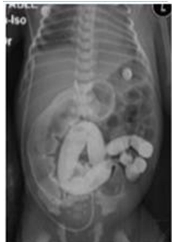
Fig. A4. Gastrografin follow through, with an interruption of gastrografin flow at a fixed dilated distal bowel.