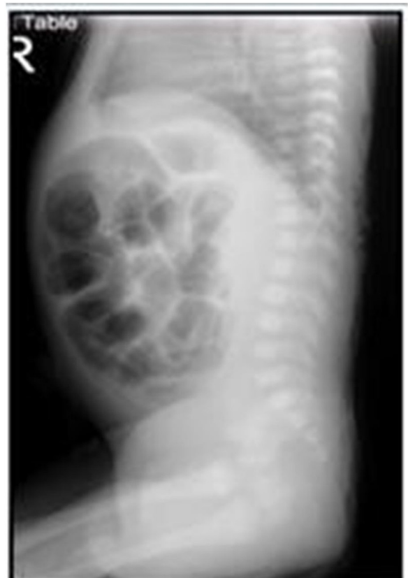
Fig. A2. Plain abdomen X-ray cross table view, showing distended bowel loops.