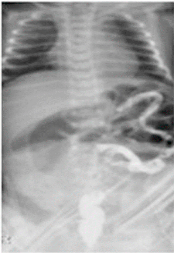
Fig. A3. Barium enema is showing microcolon with barium flow interrupted and an areathat might represent distal transverse colon.