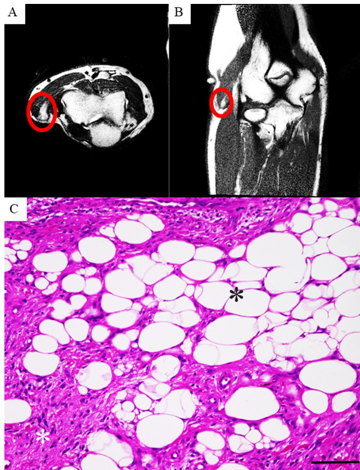
FIGURE 3: Features of the second recurrence tumor.

Magnetic resonance imaging (MRI) features of the right elbow after the second recurrence with sagittal (A) and coronal sections (B). Histology of the resected specimen (C). Atypical lipomatous cells (black asterisk). High grade spindle cells (white asterisk).