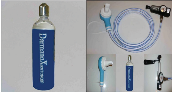
FIGURE 1: Darmanox capsule and giving set which were used in this study.