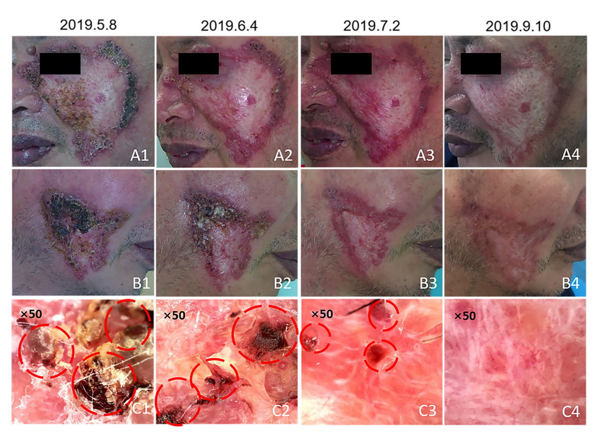
Fig. 1 Clinical manifestation of the patient observed for the first time and at follow-ups. The patient had developed multiple verrucous plaques for 8 years (a1, b1). After

4 months of treatment, the lesions significantly improved (a2-a4, b2-b4). The blackish-red dot sign (red circles) gradually disappeared during the treatment (c1-c4)