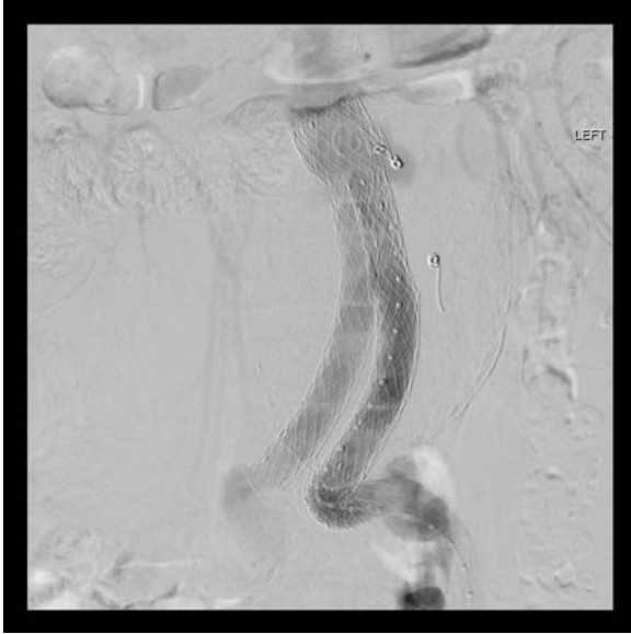
Figure 1: Digital subtraction angiography showing significant type 3a endoleak with component separation on the left iliac limb (black arrow). Both common iliac arteries were long and tortuous.