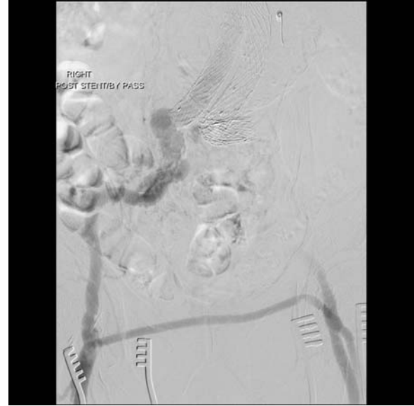
Figure 3: Angiography showing a femorofemoral crossover bypass.